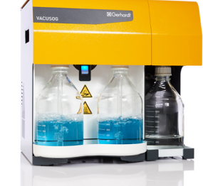
VACUSOG + ZKE (optional)

TURBOSOG with preseparator Additional cooling unit (optional) complete with water regulator