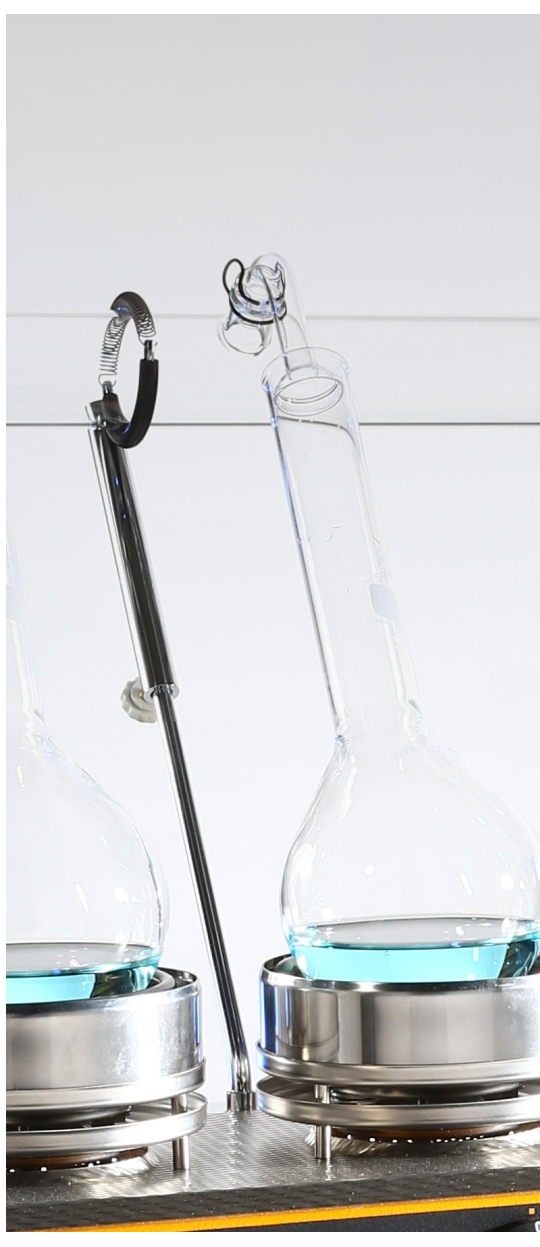
Issue 11/2019 | Subject to technical amendments