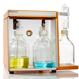
TURBOSOG + ZKE (optional)

Infinitely variable scrubber system for extracting and neutralising aggressive acid fumes